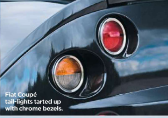
Fiat Coupé tall-lights tarted up with chrome bezels.