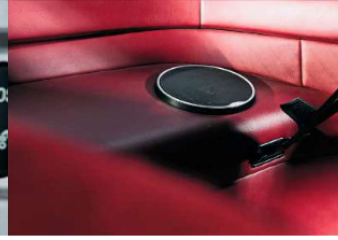
4.6-litre Ford V8 provides a baritone backing track.

I BOUGHT ONE COLIN BECKWITH I co-own this SV with my son Darryl – we bought it in one of the MG liquidation auctions, where the remaining SVs were sold at a rate of two a month. 'This is chassis 107, and was used as a company car by one of the Pheonix Four, hence the many factory upgrades – red interior, SV-R spoiler, Scorpion track exhaust and Becker sat-nav. It was also modelled by Codemasters for the TOCA: Race Driver series. Parts are obviously difficult to find, but we stockpiled some – including a set of suspension turrets and a spare gearbox. Off-the-shelf items such as brakes are easier to find. But we've been looking for a tail-light bezel for years!'