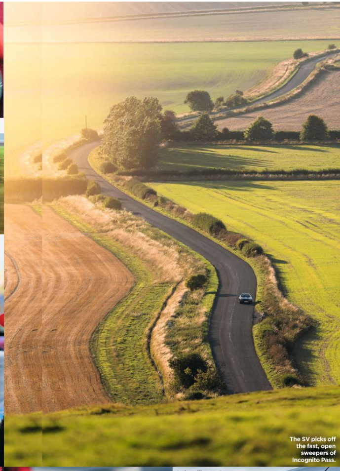
The SV picks off the fast, open sweepers of Incognito Pass.