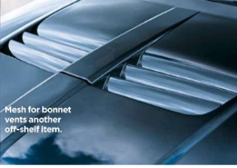
Mesh for bonnet vents another off-shelf item.