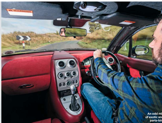
An odd mix of exotic and parts-bin.

Stuttgart snowflakes sent on their way, it's now destination Detroit as the quad-cam 4.6-litre Ford V8 – which it shares in varying states of tune with the MkVI Ford Mustang, Panoz Esperante road car and the first Koenigsegg – fires into a throbbing gargle, one that the