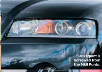
SV's squint is borrowed from the MK11 Punto.