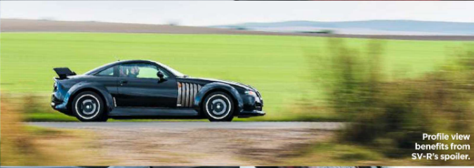
Profile view benefits from SV-R's spoiler.