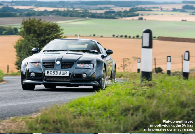
Flat-cornering yet smooth-riding, the SV has an impressive dynamic range.