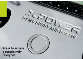
Press to access a surprisingly revvy V8.