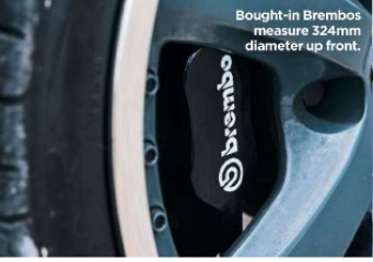
Bought-in Brembos measure 324mm diameter up front.