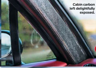
Cabin carbon left delightfully exposed.